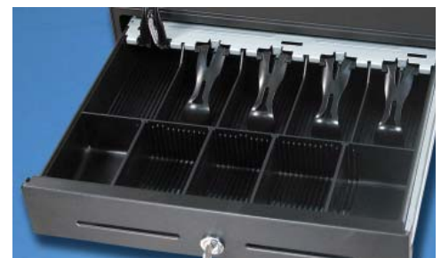
2 Media Slot Drawer with Extra Deep Insert and Adjustable Coin Dividers